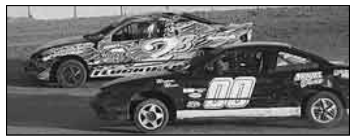
Shannon Pospisil (00) placed second in the feature as Brooke Fluckiger (2B) finished third.