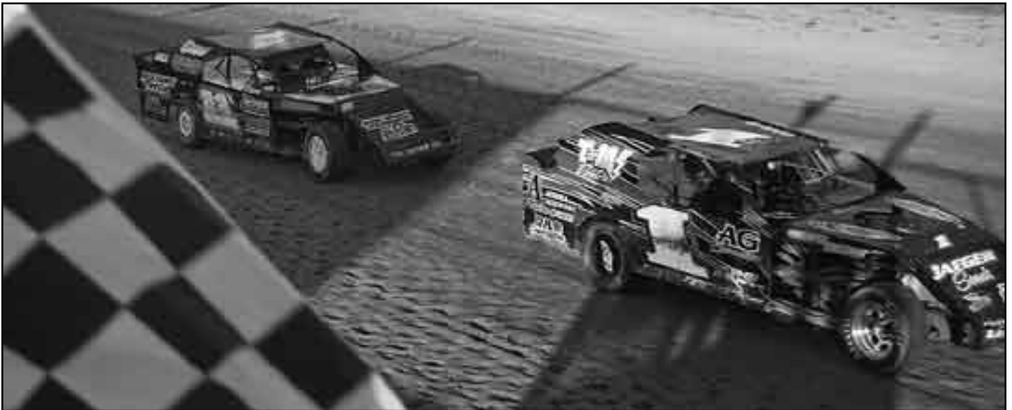
Colby Langenberg (1J) takes the checkered flag first just before Nelson Vollbrecht (11x) in their heat race.