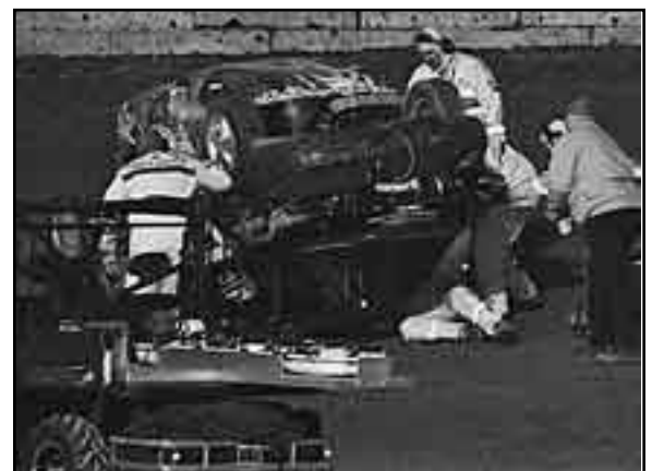
Safety crew checks on the condition of Tanner Uehling (58T) after he flipped in the feature last week.