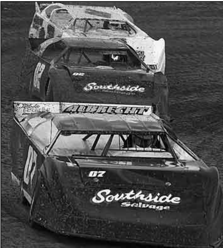
Ben Sukup (07) took second in the feature after leading 18 laps. It was his first top 5.