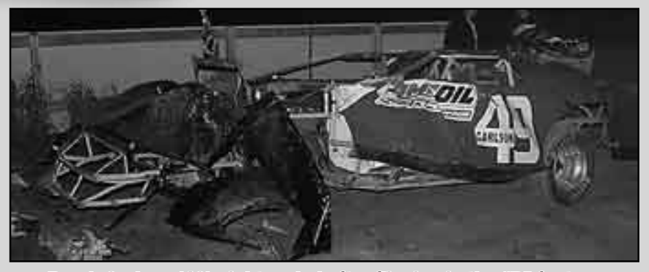
Brock Carlson (49) night ended after flipping in the "B" feature