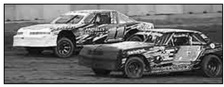
Chad Bruns (11) runs outside of Rudy Brunkhorst (57J) in their heat race. Bruns later was third in the feature.