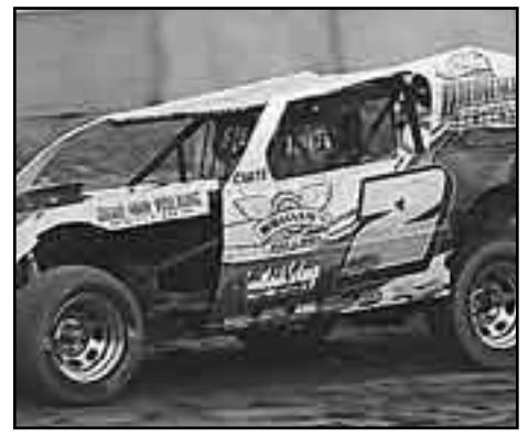
Joey Haase (2) finished just outside the top 5 in the feature at sixth place.