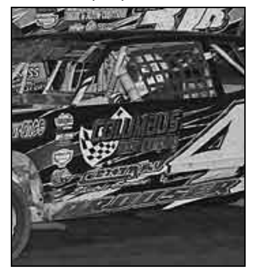
Mark Arduser (4) placed just outside the top 5 in sixth place.