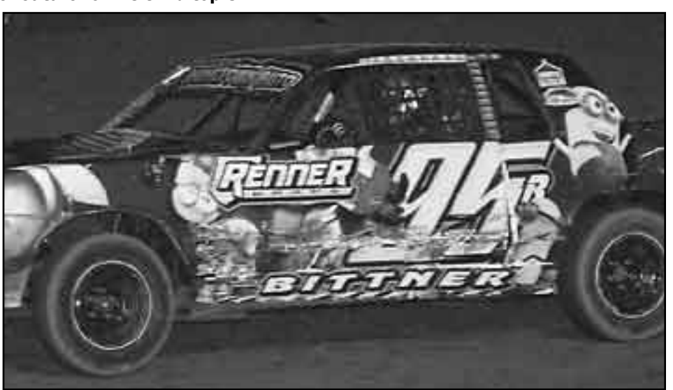
Tiffany Bittner (95B) captured her second top 5 finishing third.