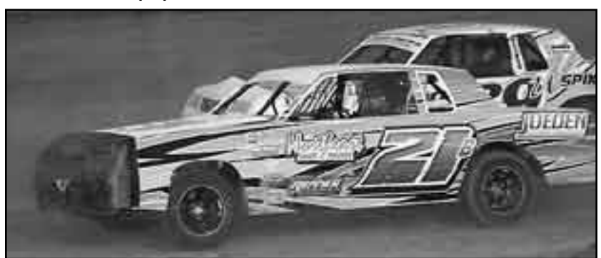
Wes Hochstein (21B) and Matt Baker (69U) exit turn two in their heat race.