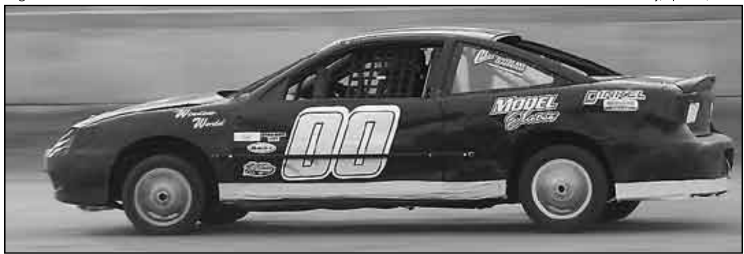
Shannon Pospisil (00) picked up his first win at the track last week.