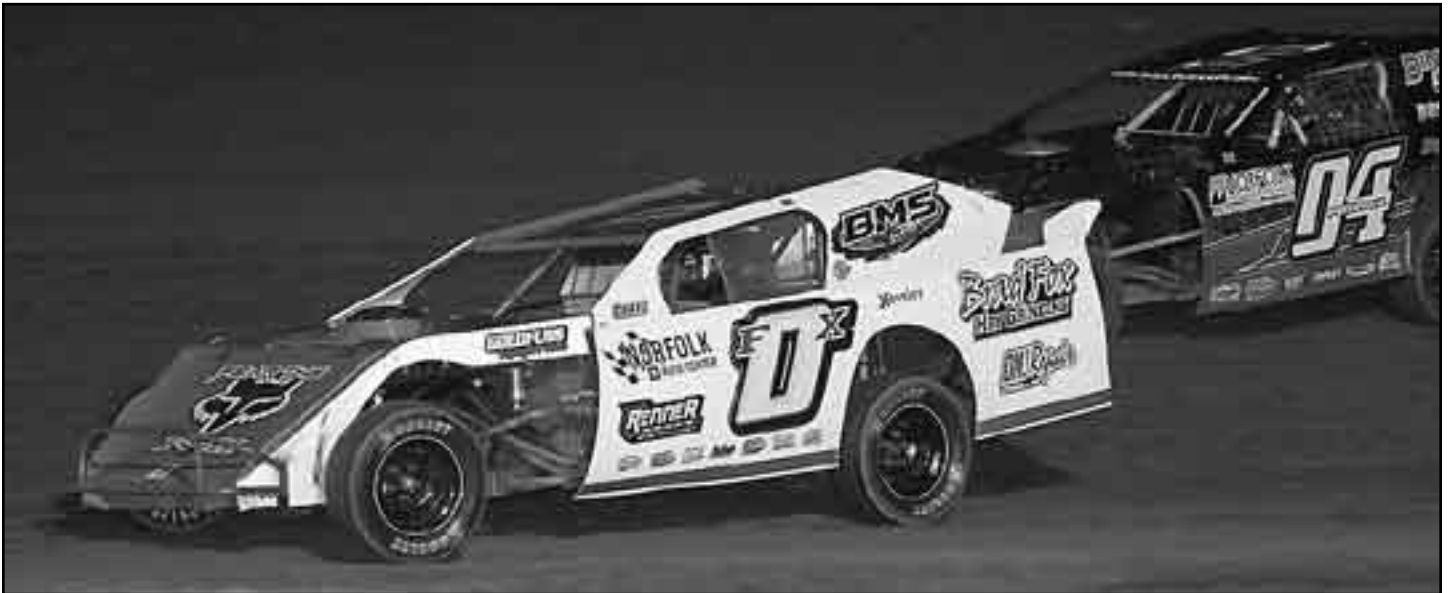
Derik Fox (0) tries to hold off Dylan Pospisil (04) in the feature. Pospisil placed fourth as Fox finished sixth.