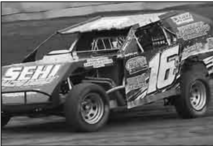
Derek Sehi (16s) took a top 5 finish in the feature.