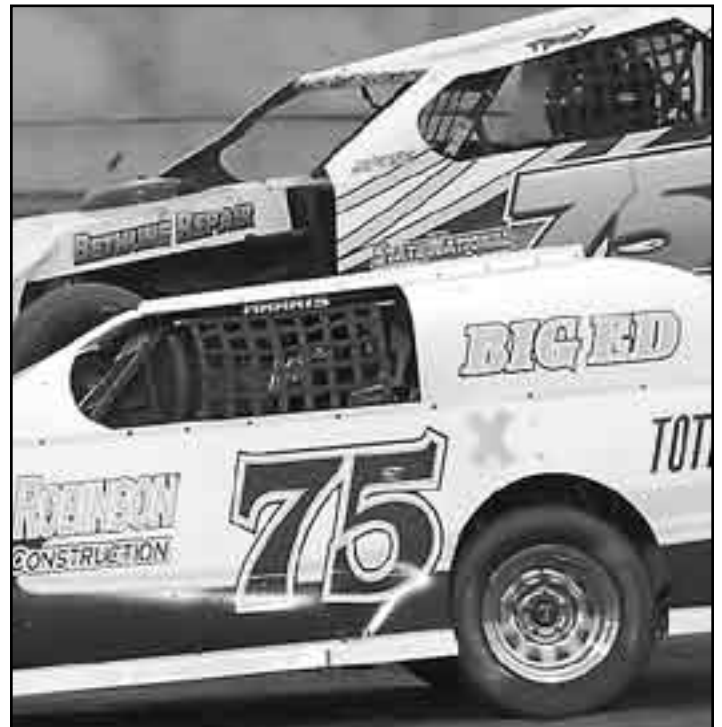
Troy Bruns (75) and James Roebuck (75X) compete in their heat race. Roebuck finished second in the race and later placed ninth in the feature.