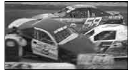
the red flag.