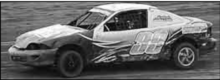
Colby Kaspar (39) finished third in the feature.