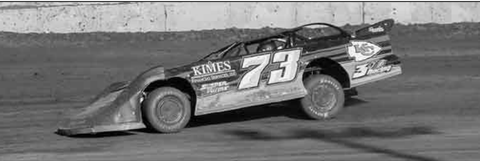
both his heat race and the feature. His first of the season and fourth at the track.