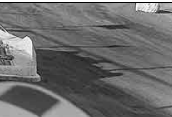
flag in their heat race.