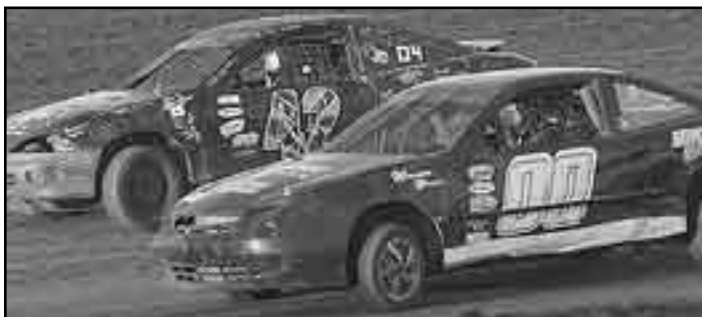
Shannon Pospisil (00) dives to the inside of Kyle Reed (42) during their heat race. Pospisil later finished third in the feature.