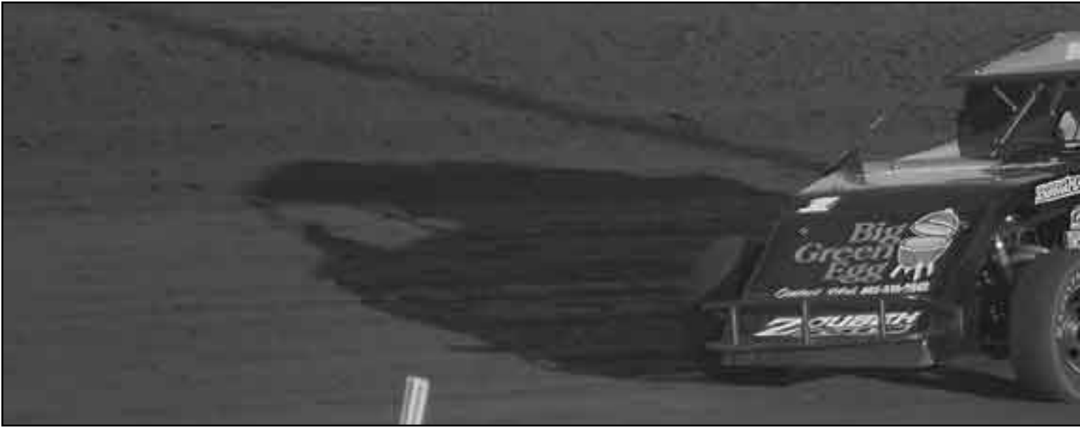
Colby Langenberg (1J) led all 20-laps to win his first feature at the track last week.