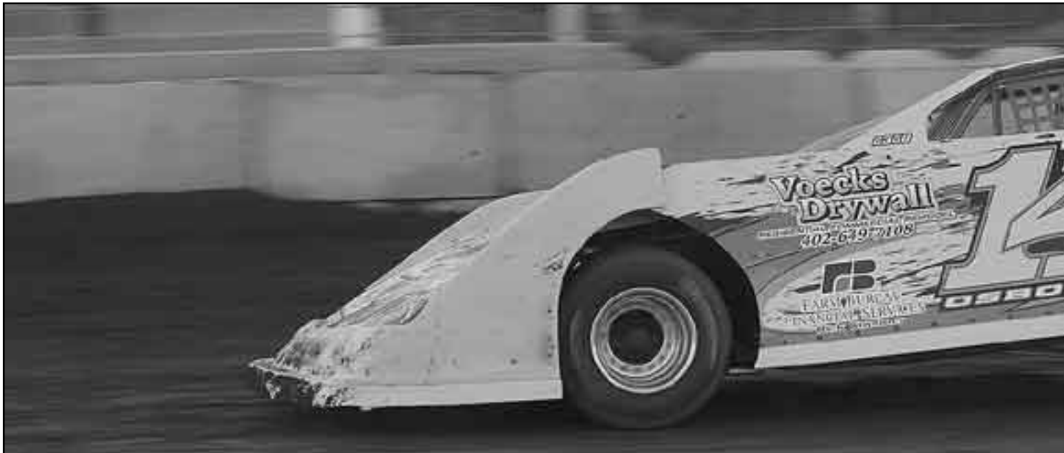
Chase Osborne (14) led 21 laps in the feature pick up the victory last week, his fourth career win at the track.