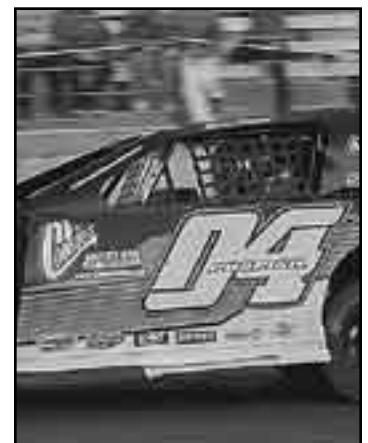
Dylan Pospisil (04) took fifth in the feature.