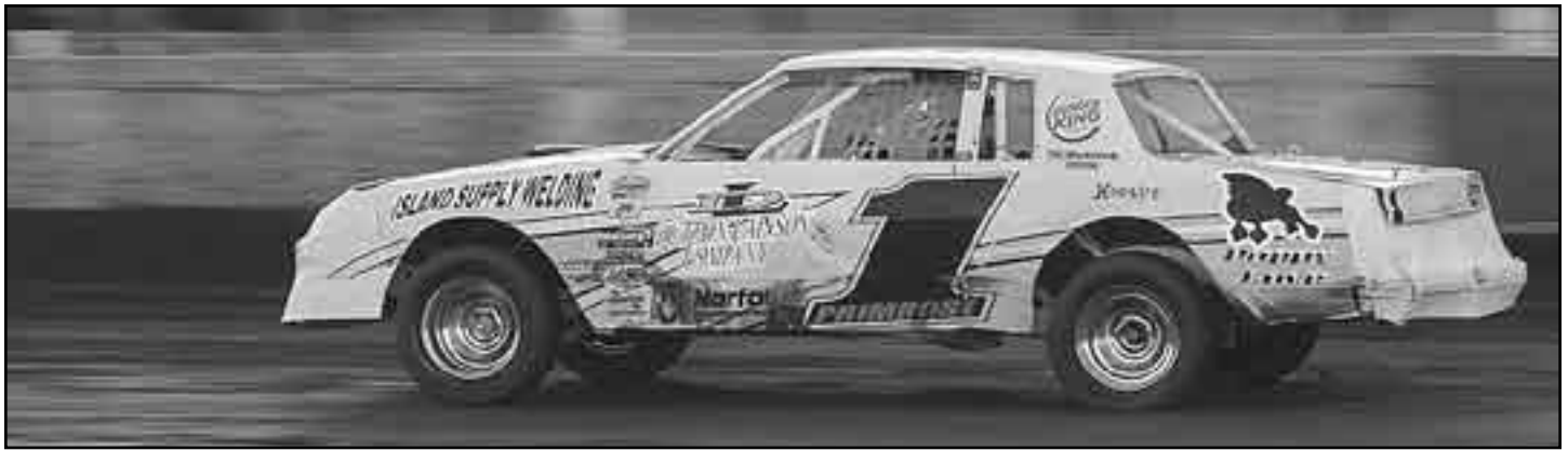
Shawn Primrose (1) led the final seven laps to win the feature last week.