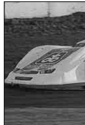
Above, Matt Haase won in a late model.