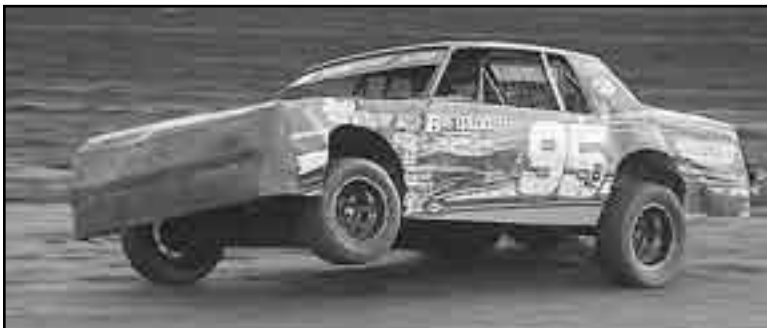
Tiffany Bittner (95B) runs three wheels through turns one and two during her heat race.