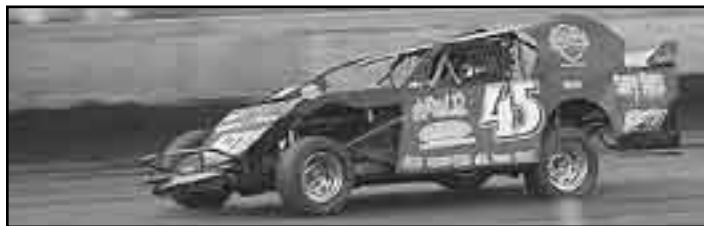
Eric Haase took a runner-up finish last week.