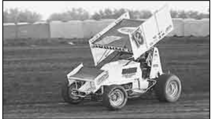
Seth Brahmer (13v) took a 11th in the feature.