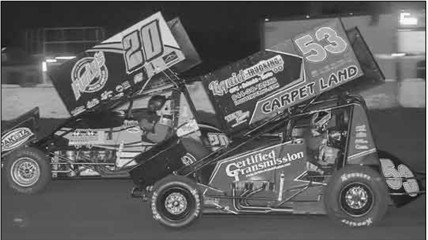
Jack Dover (53) runs the inside Brant O'Banion (20) during their heat race. Dover later won the main event.