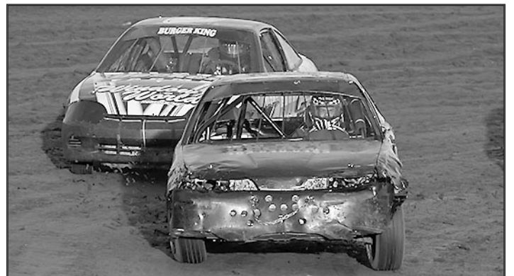
Bo Koenig (3B) led one lap in the feature last week before dropping out of the race.

Mark Benedict of Norfolk rounded out the top 5. His second top 5 of the season.