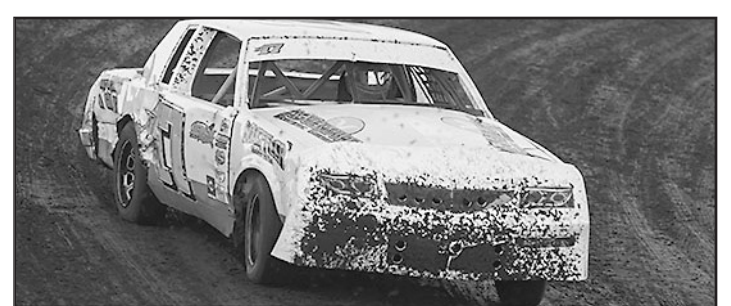
Tyler Bridges (m17) took home seventh in the feature.