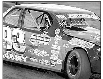
Doug Adamy led the first 10 laps and finished third in the feature.