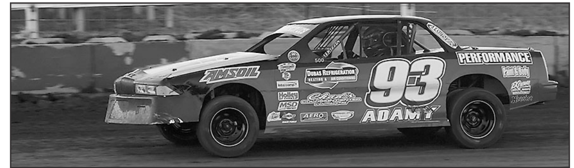
Doug Adamy (93) took second in the feature after leading the first four laps.