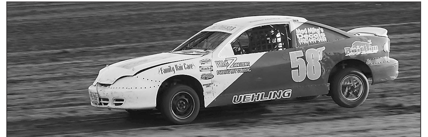
Tanner Uehling (58t) took second in the feature.