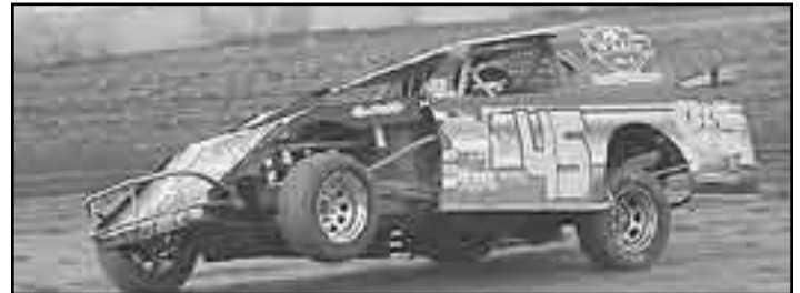
Cole Haddix (05) won the first heat race.