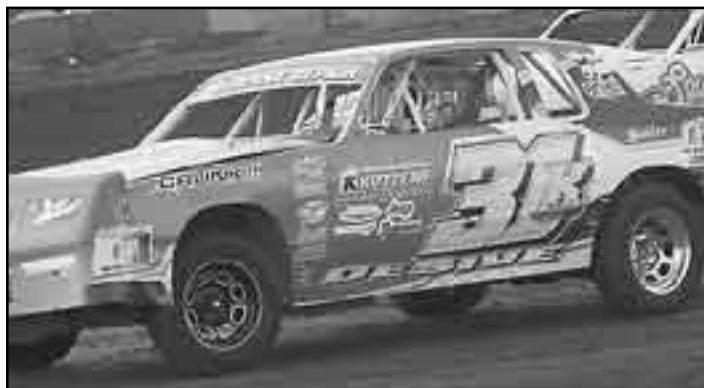
Above, Nate DeSive (31K) finished second in the feature and third in the feature. Below, Travis Coover (711) finished fifth in the feature.

Travis Coover of Neligh rounded out the top 5.