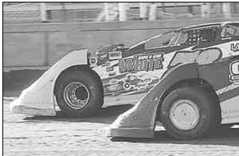
Ben Sukup (07) and Travis Birkley (78) compete in their heat race.