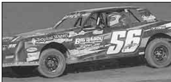
Nate Buck led all but one lap in the feature last week. He finished backwards, however, still managed a second place finish.

Rounding out the top 5 Travis Coover of Neligh.