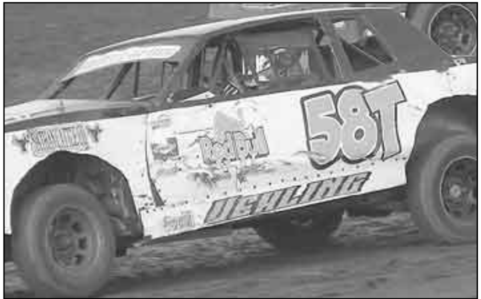
Tanner Uehling (58T) finished fourth in the feature.