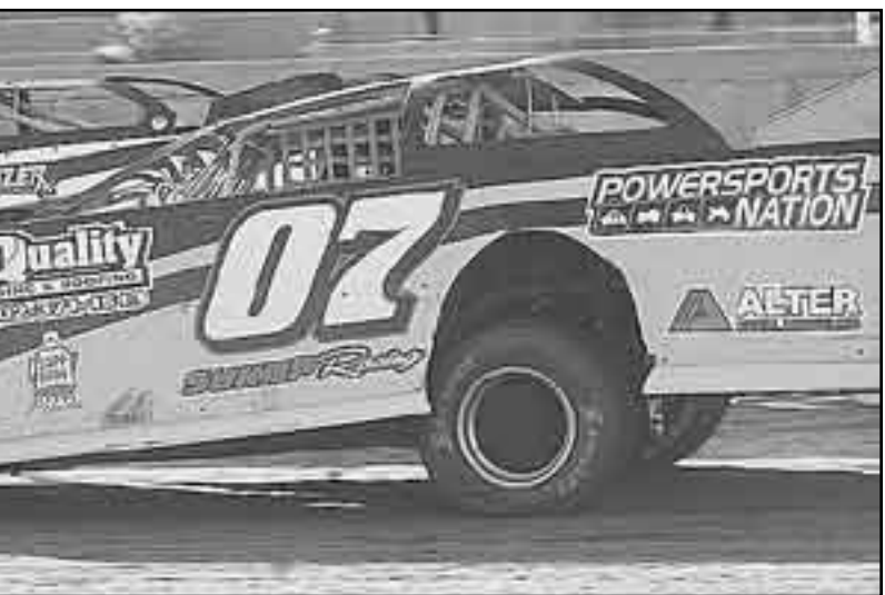
ce. Sukup took runner up in the feature as Birkley was fourth.