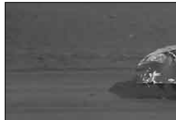
Austin Brauner (10A) took fourth in the feat