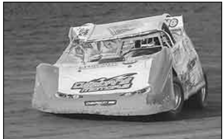
Chase Osborne finished fourth in the feature.