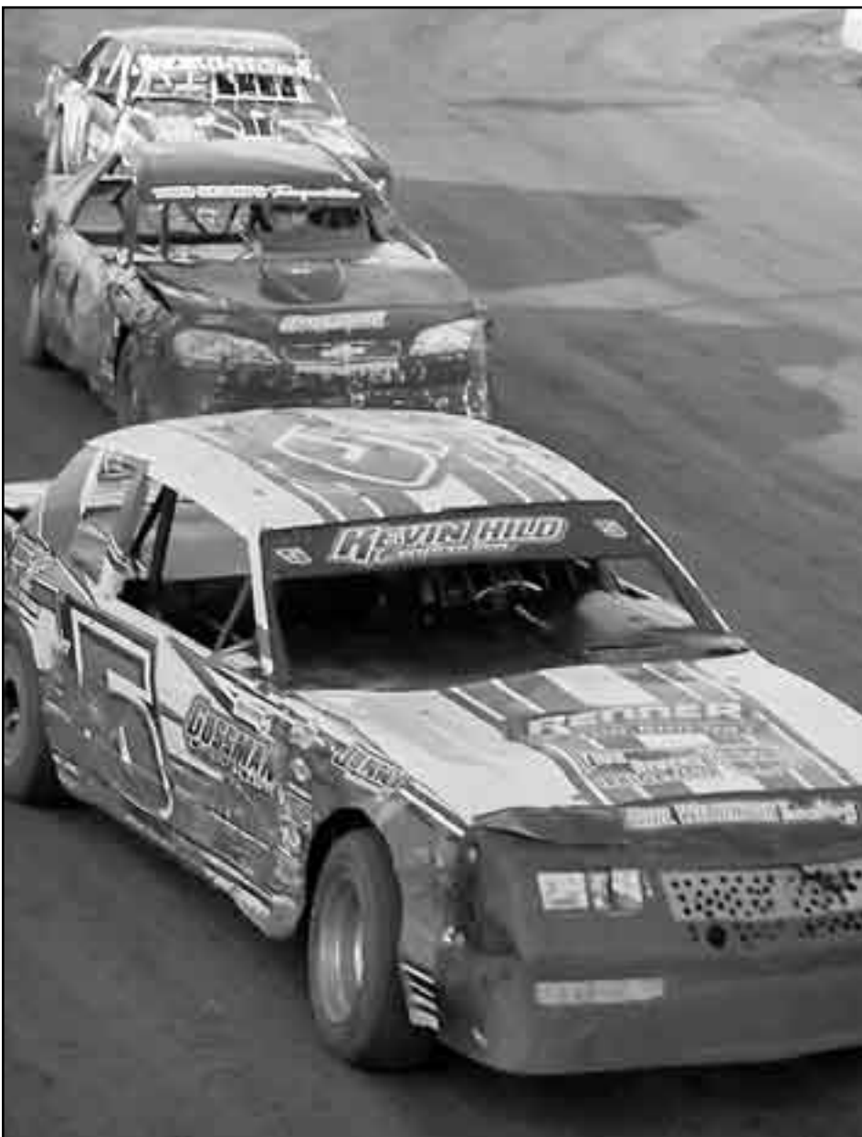
Jason Wilkinson (5) won his heat race, led four laps in the feature before placing second.