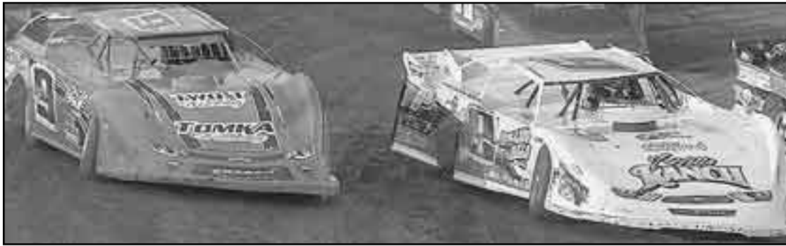
Travis Dickes (9t) races with Eric Vanosdall (9) in their heat race. Dickes finished third in the feature as Vanosdall took fourth.