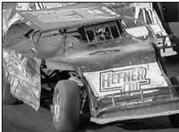
Wes Hochstein (21B) leads a group in their heat race. Hochstein won the heat race and later finished third in the feature.