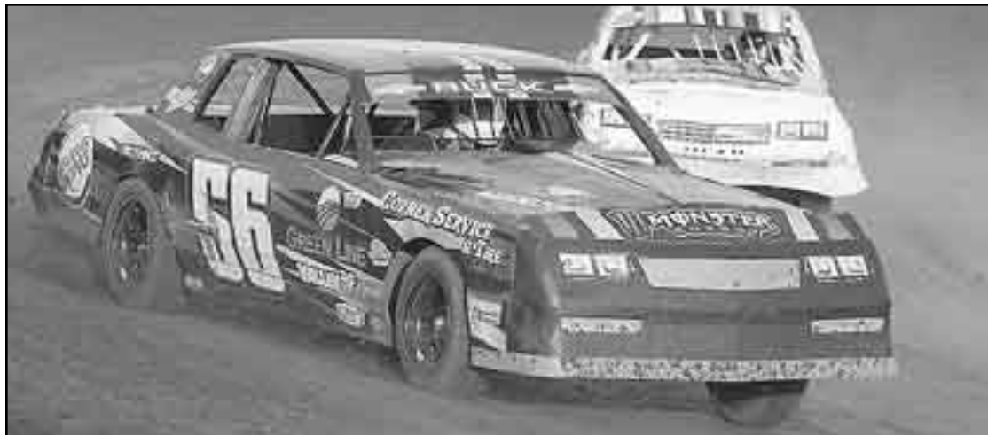
Nate Buck (56) leads Stephanie Reynolds (96R) out of turn four in their heat race. Buck finished second in the feature as Reynolds led five laps in the feature.