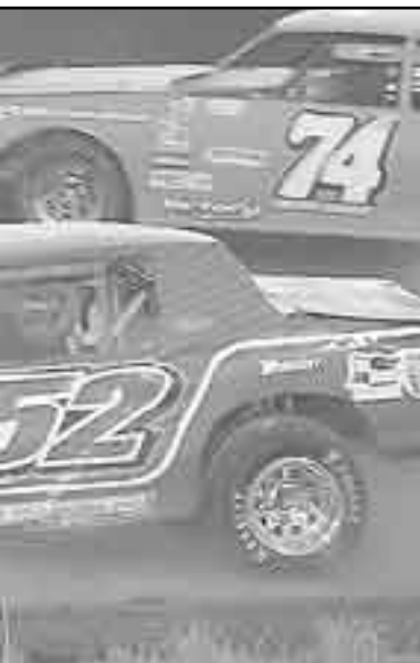
from the race with damage.